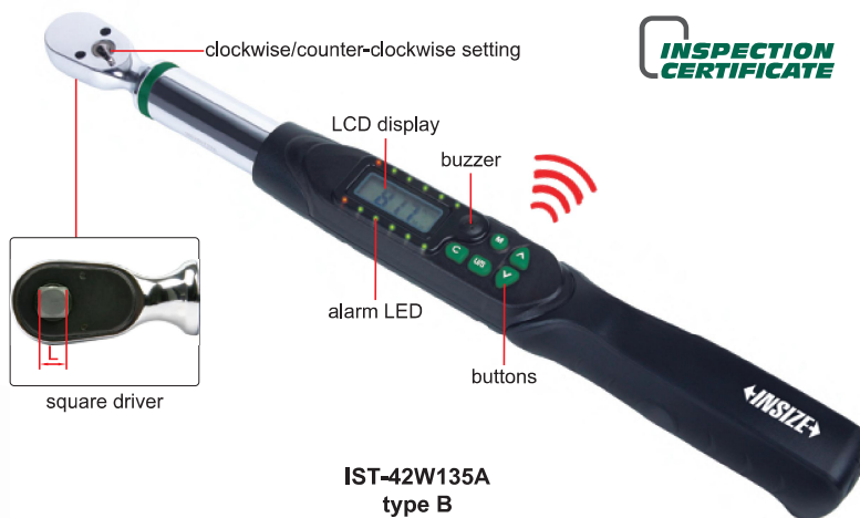
IST-42W135A type B