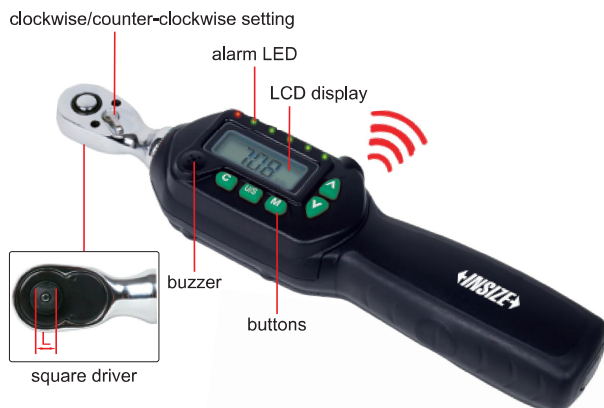
IST-42W12A type A